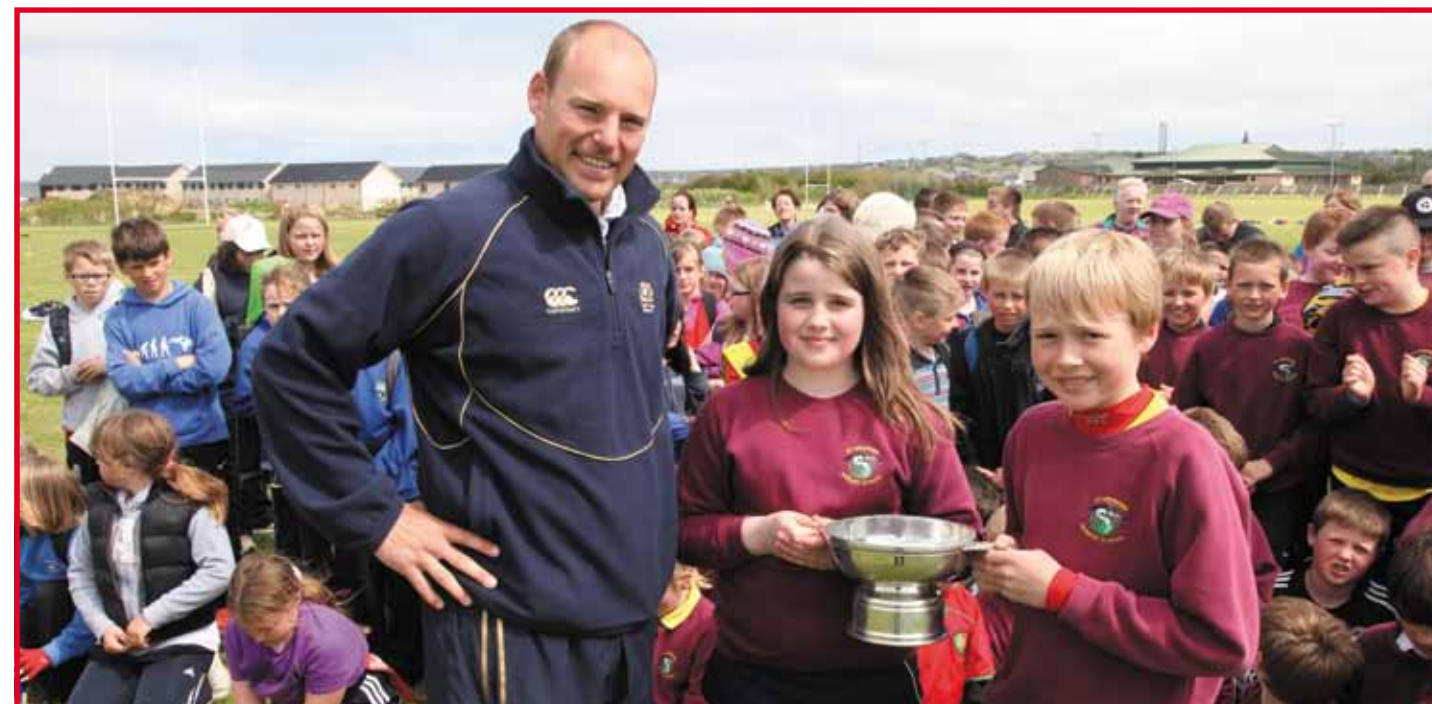
St Andrews P7 pupils receiving their Schools Morrisons Construction award for contributions towards Community Rugby Award.

ORKNEY RFC COMMUNITY SCHOOLS TAG FESTIVAL 7TH JUNE